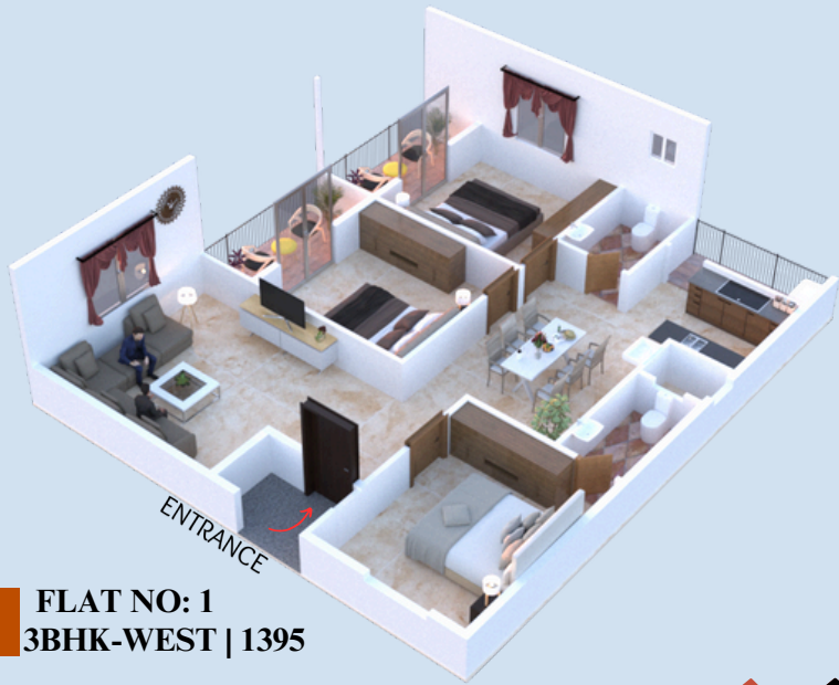
FLAT NO: 1 3BHK-WEST | 1395