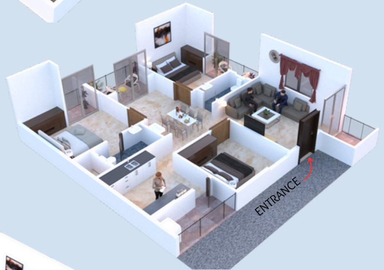
FLAT NO: 5 3BHK-EAST | 1395