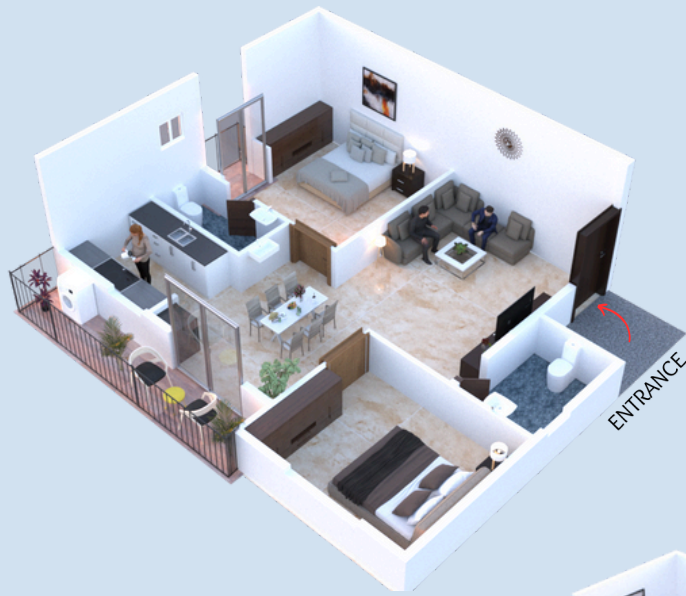
FLAT NO: 2 2BHK-NORTH | 945