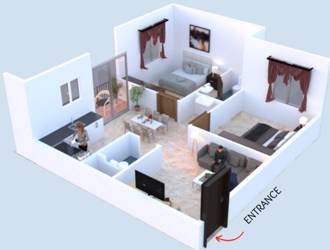
FLAT NO: 3 2BHK-NORTH | 838