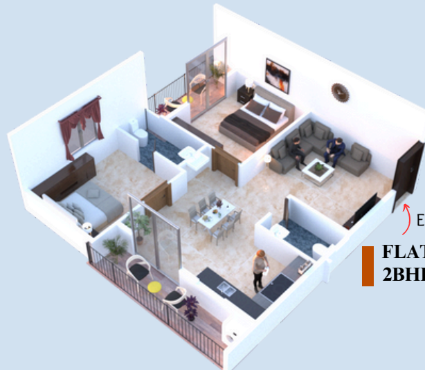
FLAT NO: 4 2BHK-EAST | 961