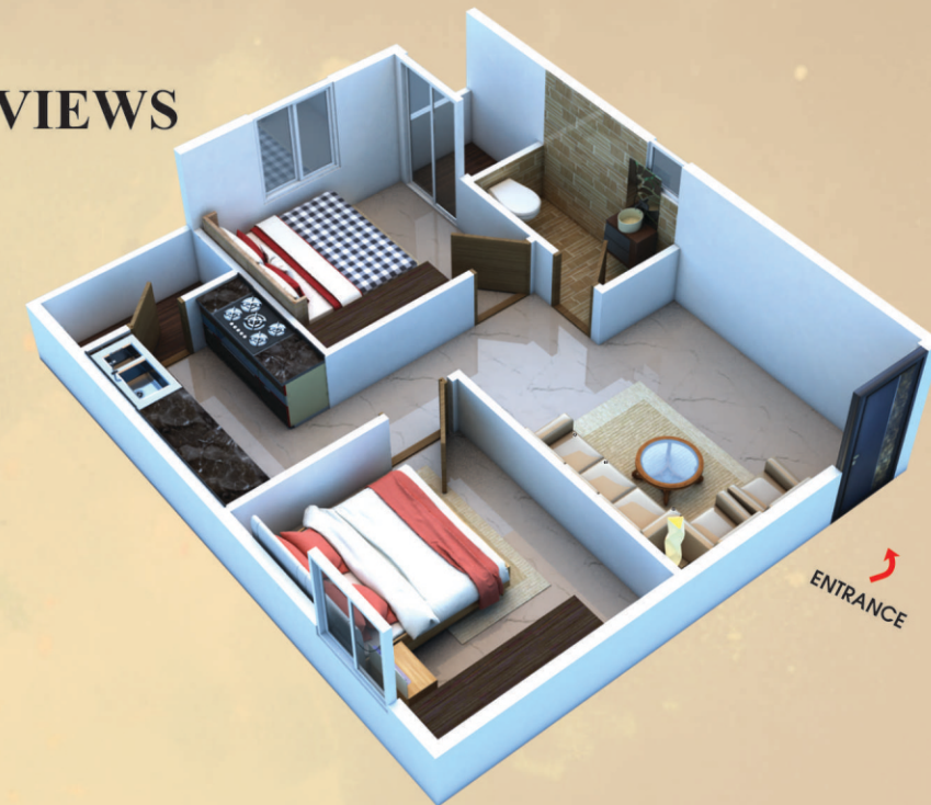
FLAT NO: 6 2 BHK-South | 792 SFT