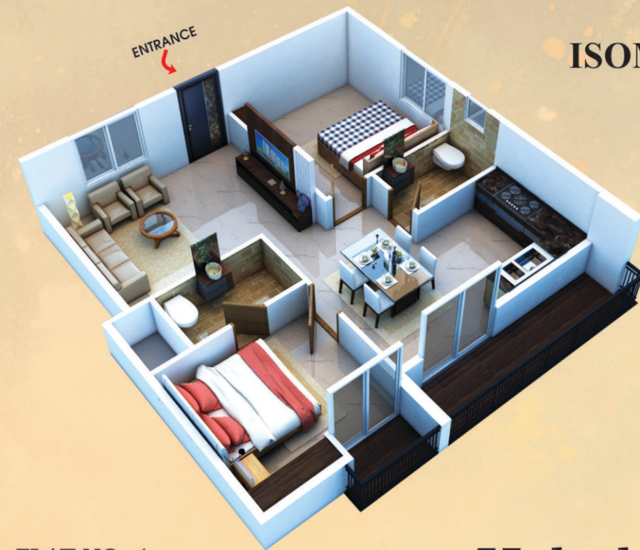
FLAT NO: 4 2 BHK-North | 1152 SFT