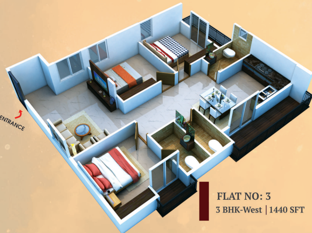
FLAT NO: 3 3 BHK-West | 1440 SFT