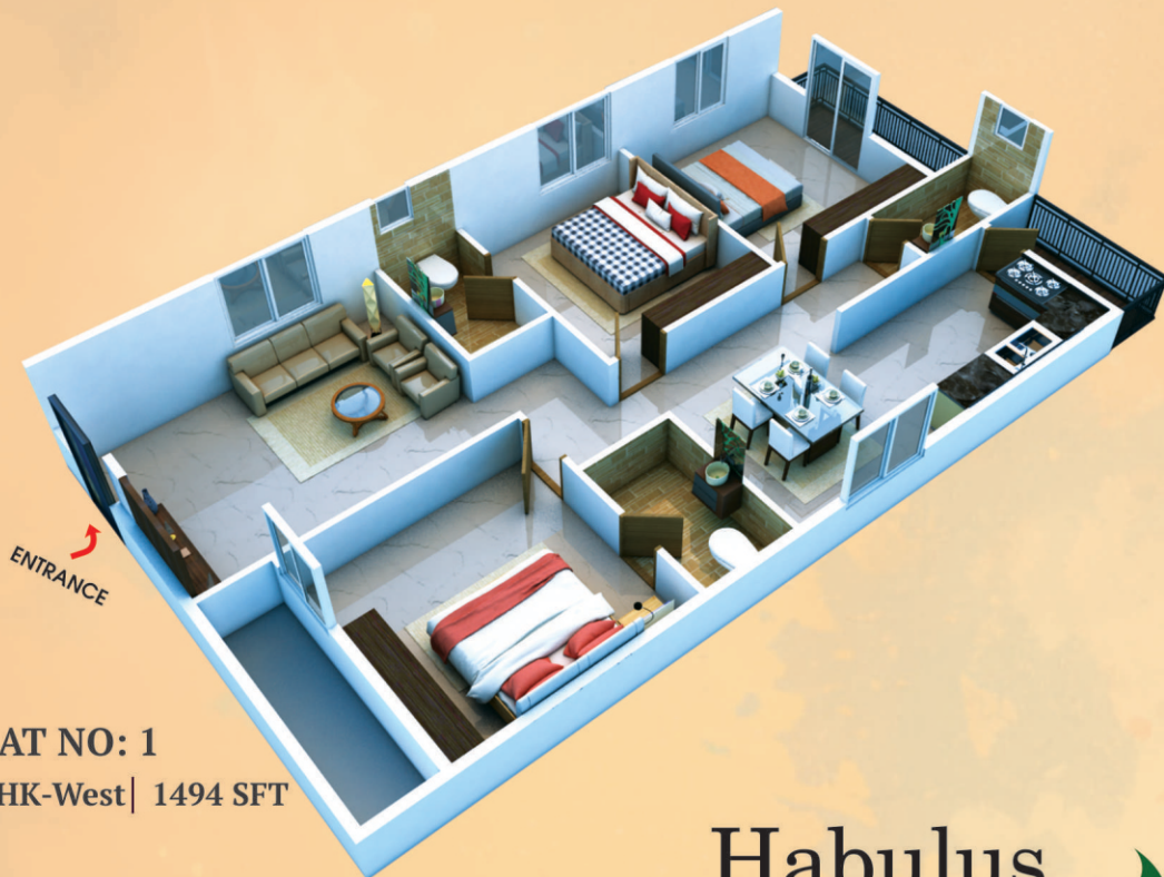
FLAT NO: 1 3 BHK-West | 1494 SFT