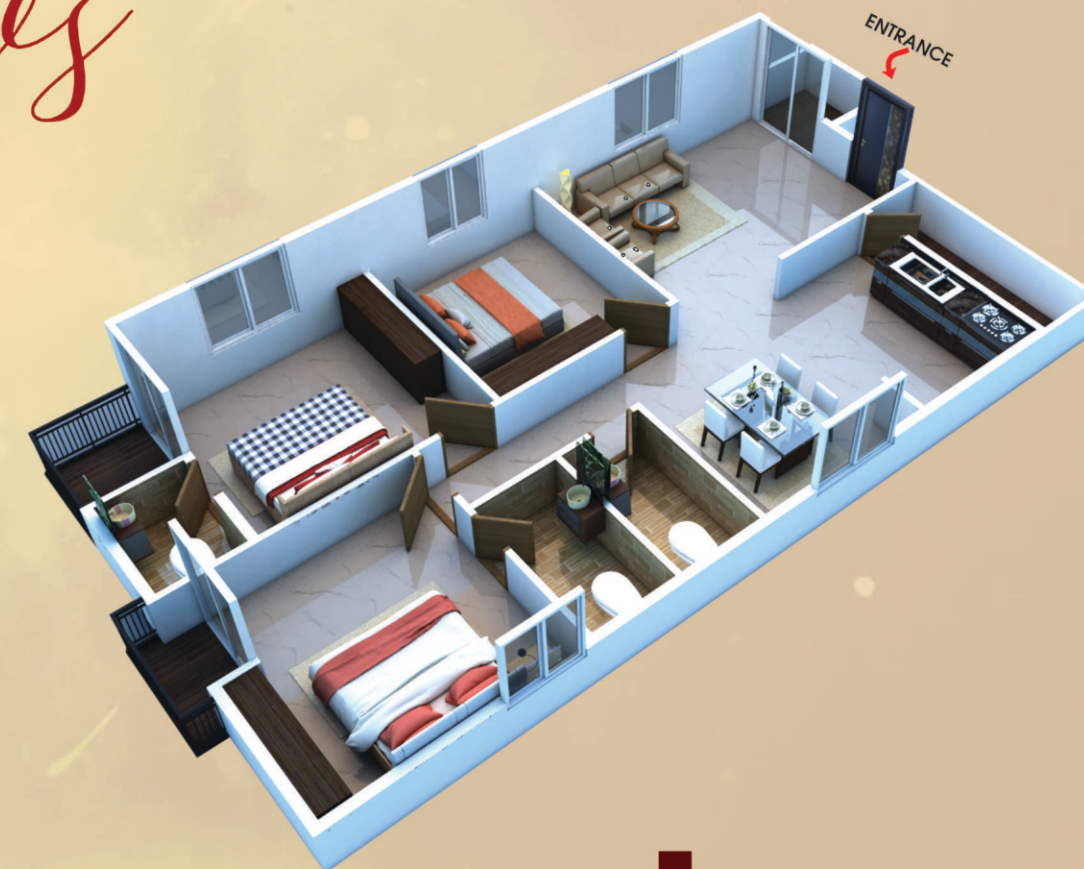
FLAT NO: 9 3 BHK-East | 1440 SFT