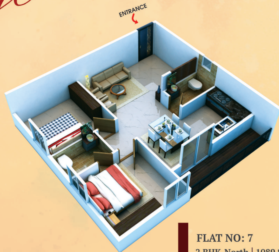
FLAT NO: 7 2 BHK-North | 1089 SFT