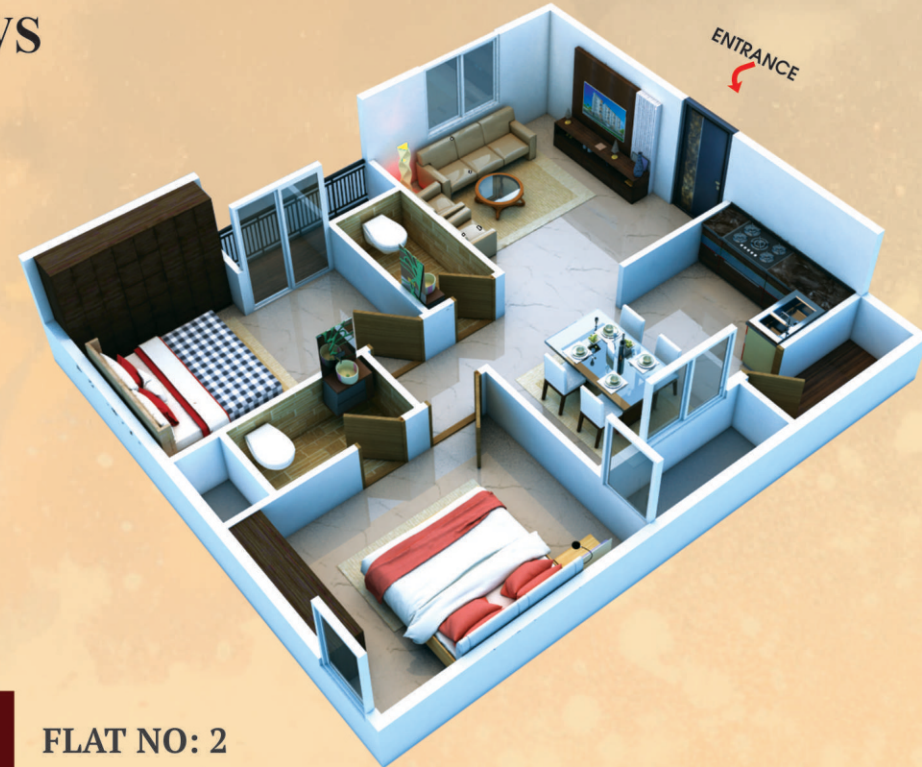
FLAT NO: 2 2 BHK-East | 1053 SFT