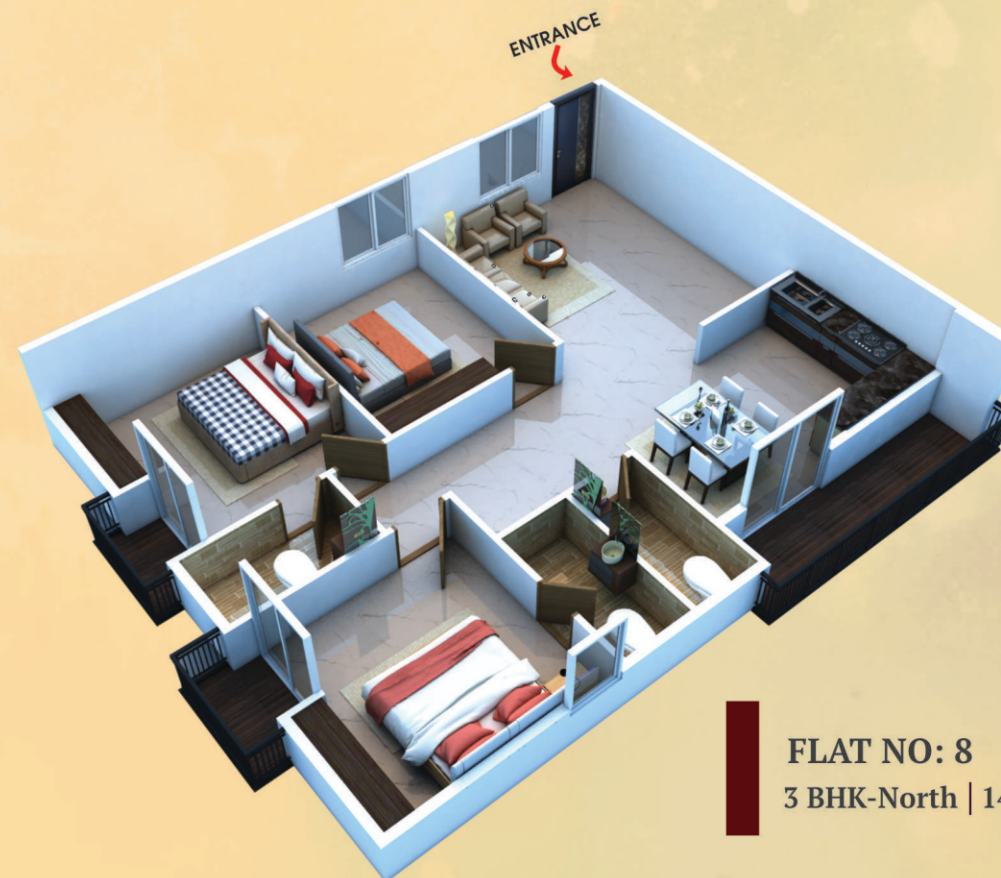
FLAT NO: 8 3 BHK-North | 1458 SFT