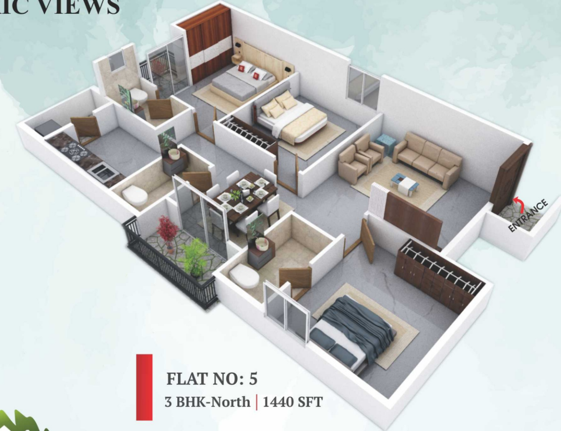
FLAT NO: 5 3 BHK-North | 1440 SFT