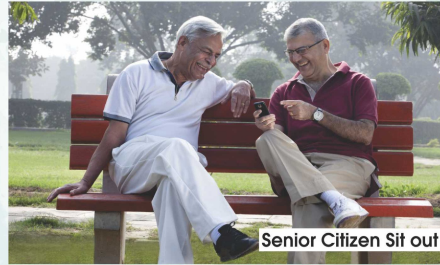
Senior Citizen Sit out