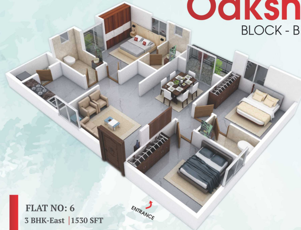
FLAT NO: 6 3 BHK-East | 1530 SFT