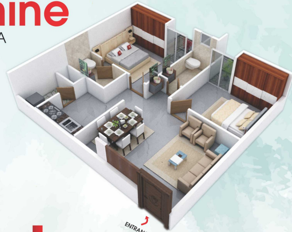
FLAT NO: 8 2 BHK-East | 999 SFT