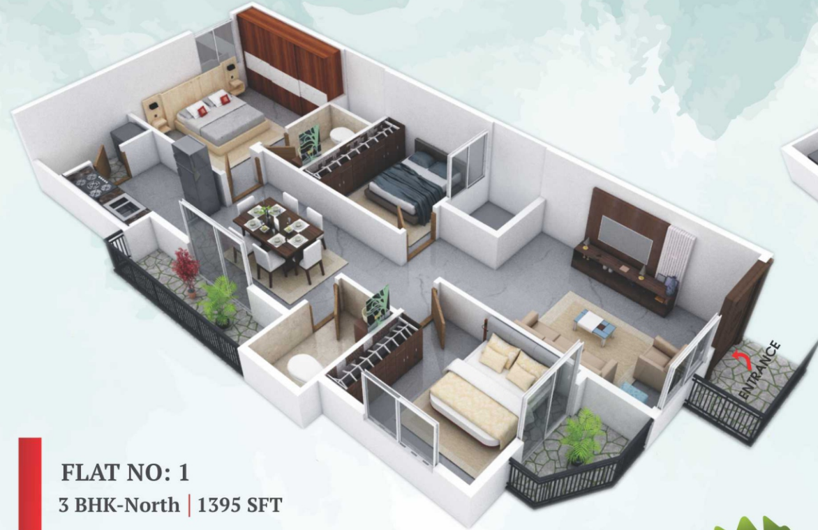
FLAT NO: 1 3 BHK-North | 1395 SFT