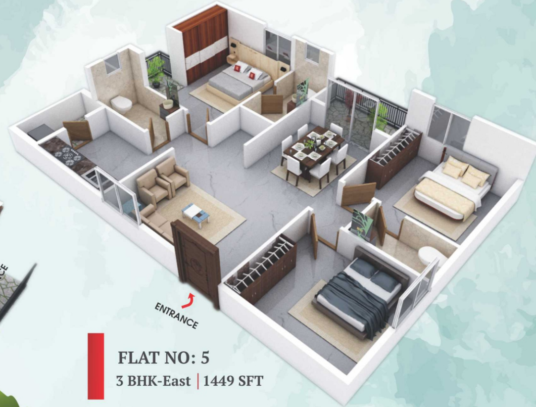
FLAT NO: 5 3 BHK-East | 1449 SFT