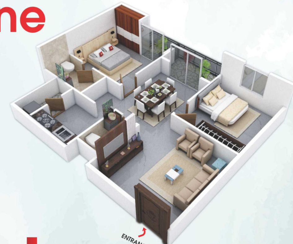
FLAT NO: 8 2 BHK-East | 1179 SFT