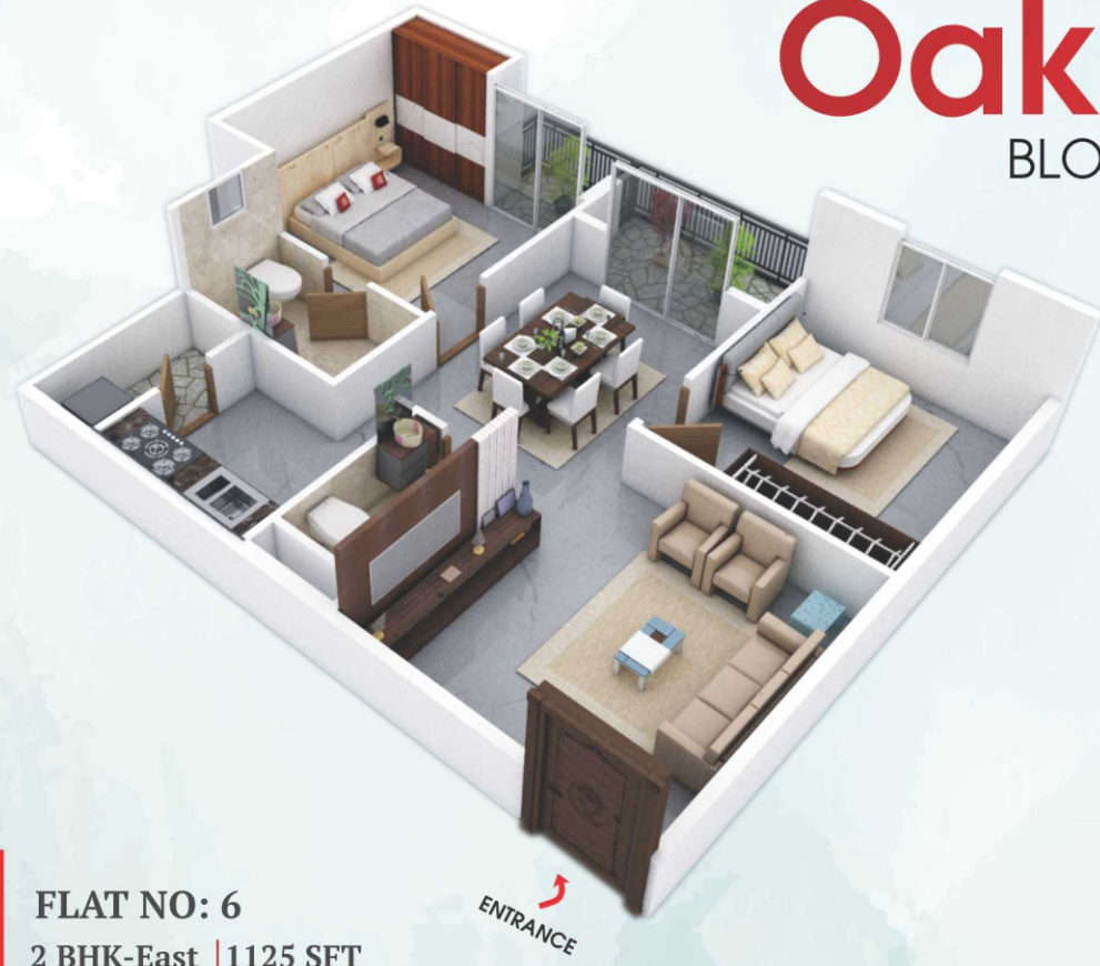
FLAT NO: 6 2 BHK-East | 1125 SFT