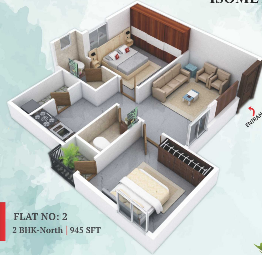
FLAT NO: 2 2 BHK-North | 945 SFT