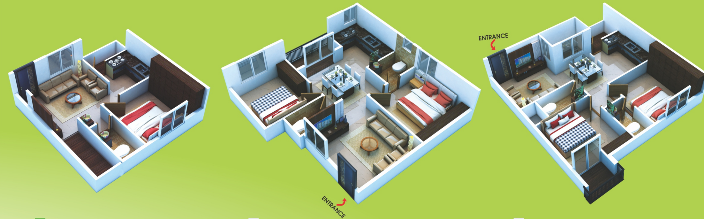
FLAT NO: 2 2 BHK-East | 792 SFT