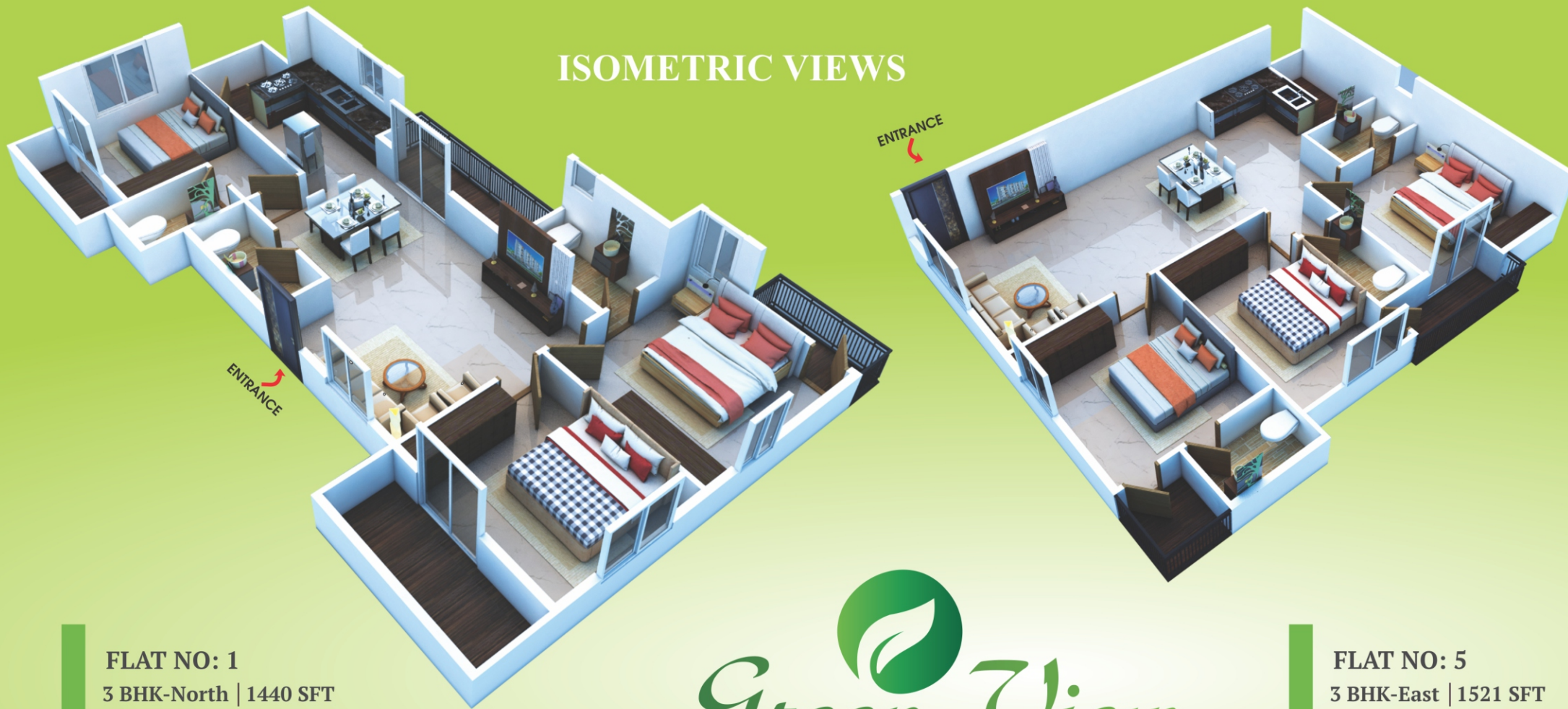
FLAT NO: 1 3 BHK-North | 1440 SFT