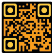
Sri Sai Uphara Restaurant